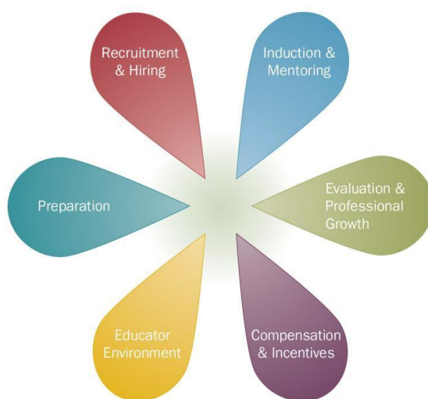
Figure 1: Talent Management. This figure depicts the systems that develop and support educators.

Similar to all professionals, U.S. Virgin Islands Department of Education (VIDE) coordinators need evidence-based feedback and professional supports to continue to grow in their positions. Research has associated these types of supports with increased job satisfaction, retention, and performance improvement. Current efforts to improve educational administrators recognize the importance of managing talent across the career continuum. Managing educator talent requires coherence among systems that wrap around and support educators (see Figure 1) and coordination between districts, departments of education, leader preparation programs, and other entities (Behrstock-Sherratt, Meyer, Potemski, & Wraight, 2013).