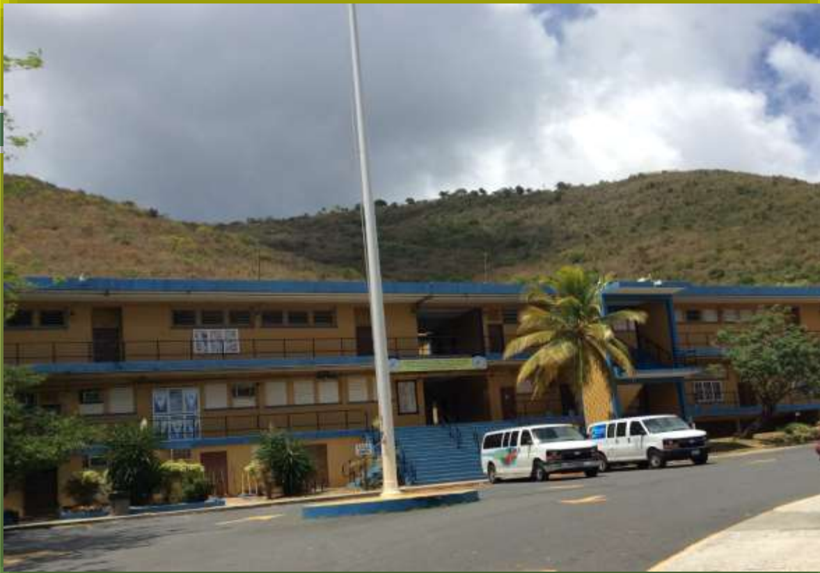
Charlotte Amalie High School - STT